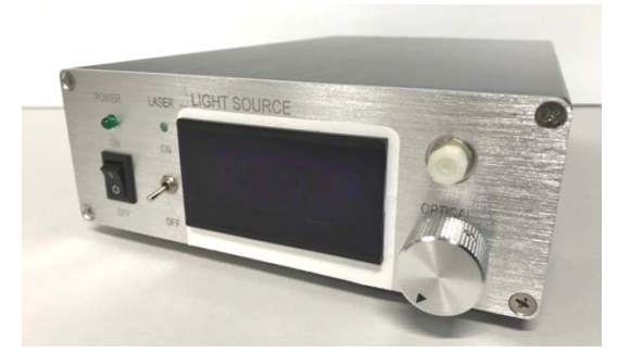
OEBLS-200A, with current display