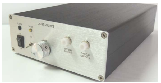
OEBLS-200, without current display