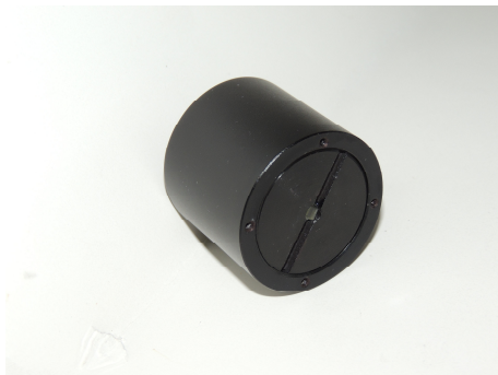
Fig. 1. Free Space Isolator