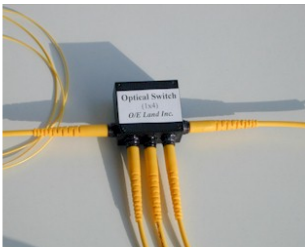
Figure 2. Customer Made 1 x 4 Wide Band Optical Switch