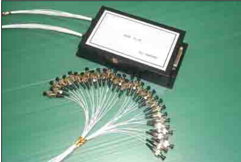
Figure 1. 1 x 32 Single Mode Optical Switch Module